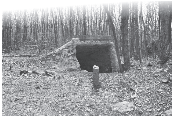
Abandoned Slope Mine Opening

Abandoned horizontal mine openings leading into underground tunnels may seem safe and sturdy to the untrained person, but are prone to cave in. They contain many hazards such as rotten roof support beams, deadly odorless gases, poisonous snakes, vertical shafts in the tunnel floors, and flooded sections. Darkness and sharp objects hanging from the roof add to these underground mine hazards.