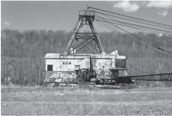
Abandoned Equipment is Dangerous

Pennsylvania is home to approximately 250,000 acres of abandoned mine lands as a result of decades of unregulated mining. Years ago, before modern environmental regulations, mine operators were not required to return the land to its original condition (or reclaim it) after mining was completed. As a result, there are open mine shafts, large water-filled pits, and other hazards throughout the state.