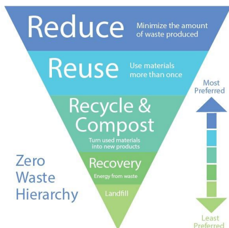
THE WASTE HIERARCHY

Why is this important? Mostly because it demonstrates the Chester County public is concerned about solid waste generation and disposal. Chester County's population is growing , and everyone creates trash for our two landfills. Can something be repaired, donated or reused? Can the item be recycled somewhere other than your convenient curbside or drop off system?